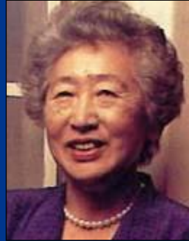
Sadako Ogata 1951-52