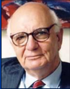
Paul Volcker, Jr. 1951-52