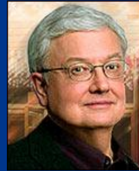
Roger Ebert 1964-65