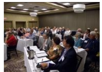
Zone 34 Foundation Seminar participants

While no specific date has yet been set, it is anticipated that the ninth consecutive Zone 34 Rotary Foundation Seminar will be held in Evanston next spring in late May or early June.