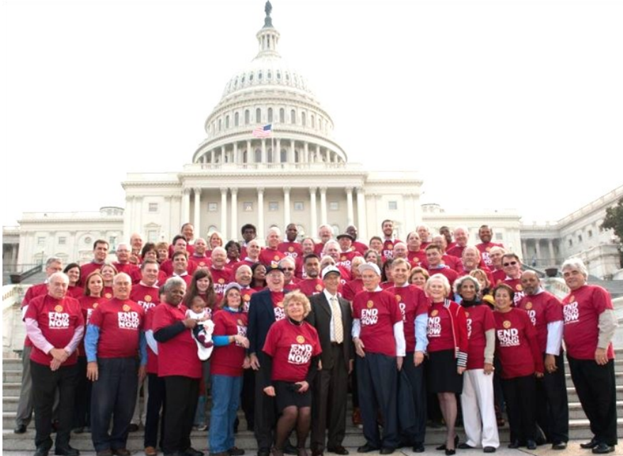
Rotarians gathered on the steps of the U.S. Capitol to celebrate World Polio Day with Bill Gates.